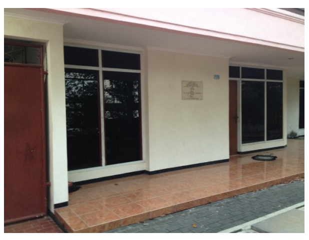
Our guest house