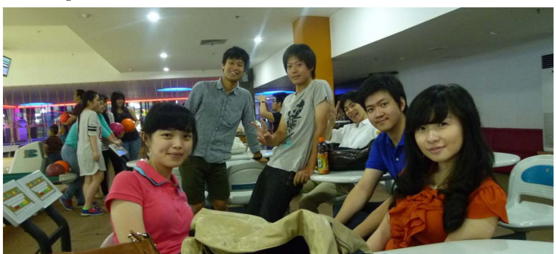
Bowling with medical students

Mt. Bromo is a volcano 90 km in the south of Surabaya. In order to see sunrise, we left our guesthouse at 11 pm and arrived there 3 am. We had to wait for sunrise beneath cold skies. But it was worth waiting. It was the most beautiful sunrise I have ever seen. I want to share the feeling I felt there, so I recommend you to climb up Mt. Bromo.